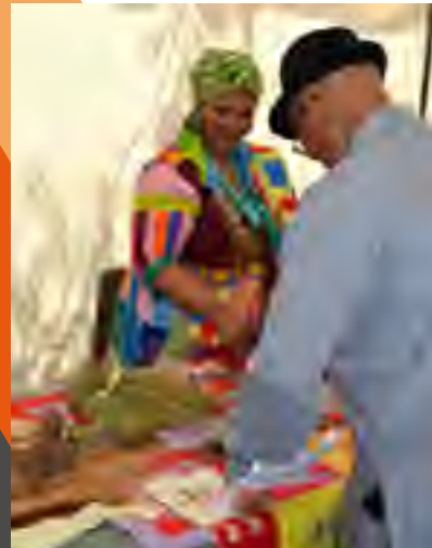
A local traditional healer helped to create the new display on traditional Nama medicine and there was a stall where the public could buy. A large doll was also designed by a member of the new Museum Advisory Committee to help name and explain the different features of a Nama woman's dress.