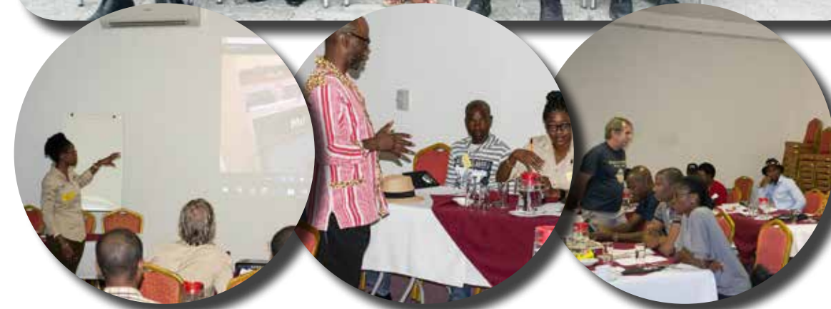
Oombale Dhihaka Stakeholders Workshop, Ondangwa