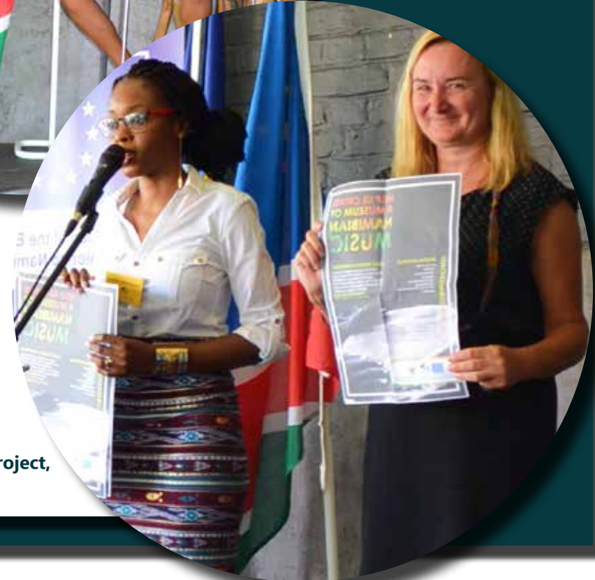
Launch of European Union Project, Windhoek