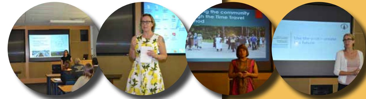
Museum Education Workshop, National Archives of Namibia