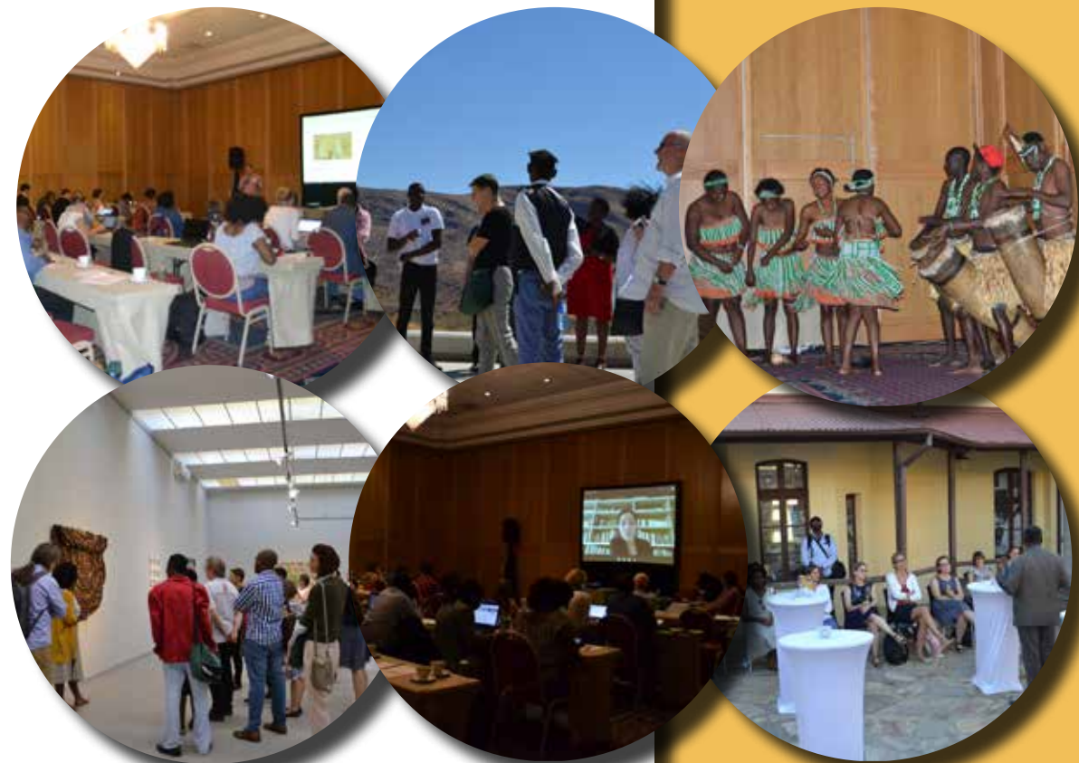
International Committee for Training of (Museum) Personnel (ICTOP) Conference, Windhoek