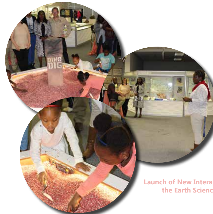
Launch of New Interactive Displays at the Earth Science Museum