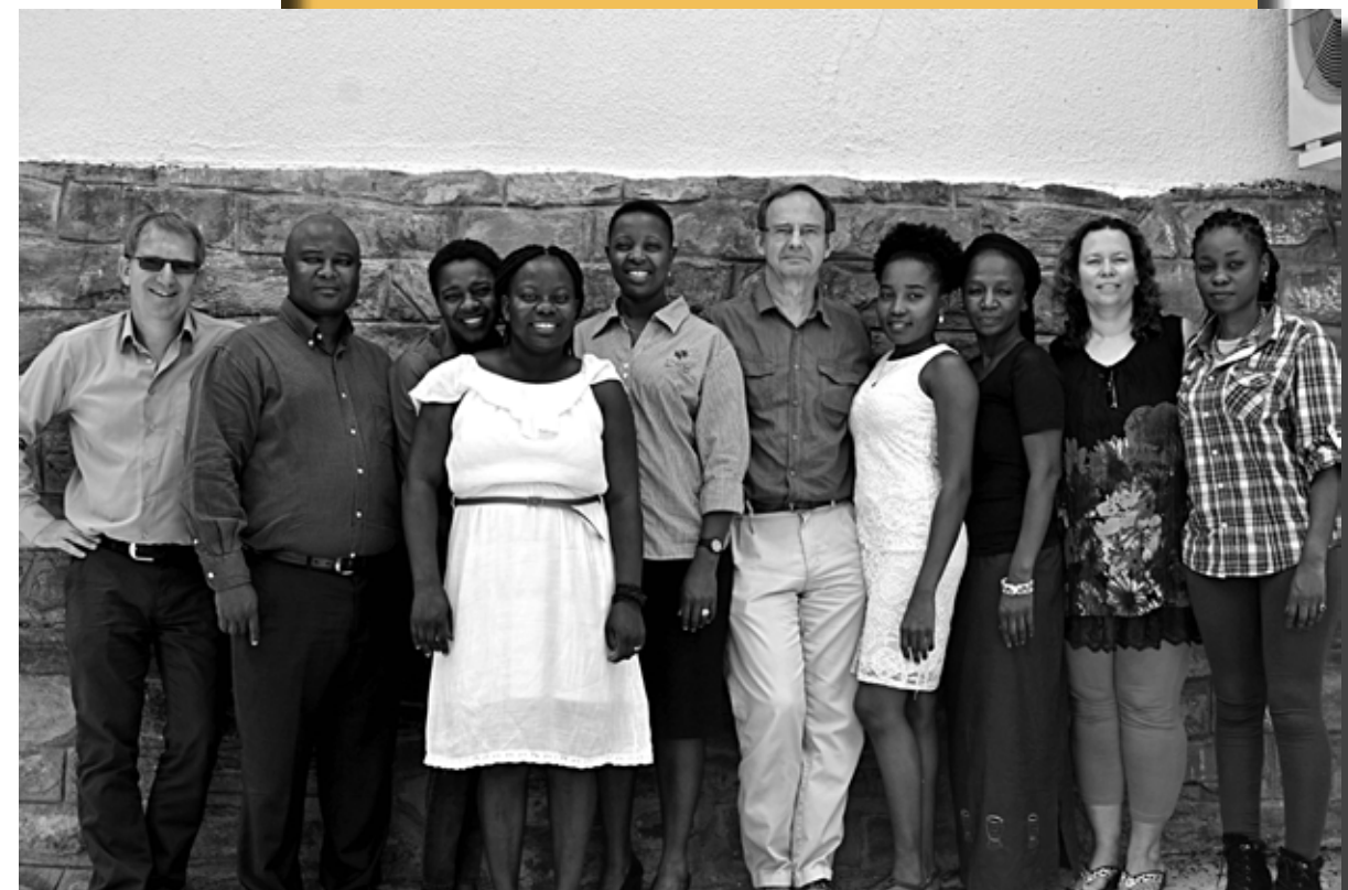
MAN Executive Committee Meeting

A meeting took place about potential collaboration in areas such as the circulation of exhibitions, training and the annual school competition.