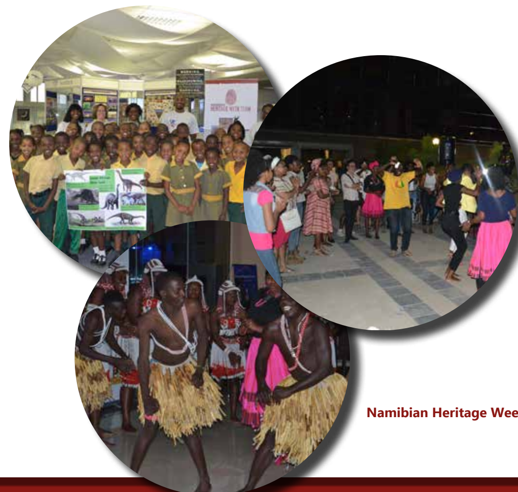
Namibian Heritage Week