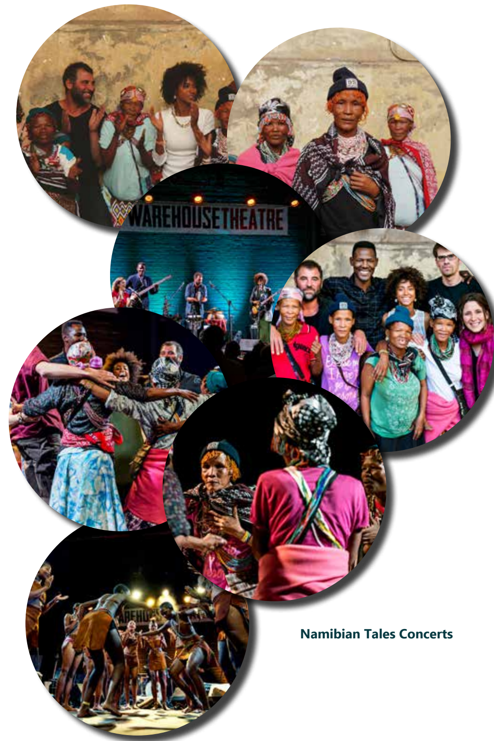
Namibian Tales Concerts