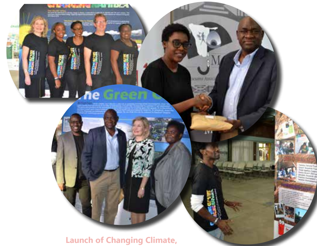
Launch of Changing Climate, Changing Namibia Mobile Exhibition

Two new displays – a dig for dinosaur bones and an earthquake simulation had been constructed and installed with funding provided by a regional museum development grant from MAN. Grants were made in 2016/17 with funds from the annual grant-in-aid provided to MAN by the Ministry of Education, Arts and Culture. Unfortunately, due to cuts in the grant it will not be possible to award regional museum development grants in this financial year.