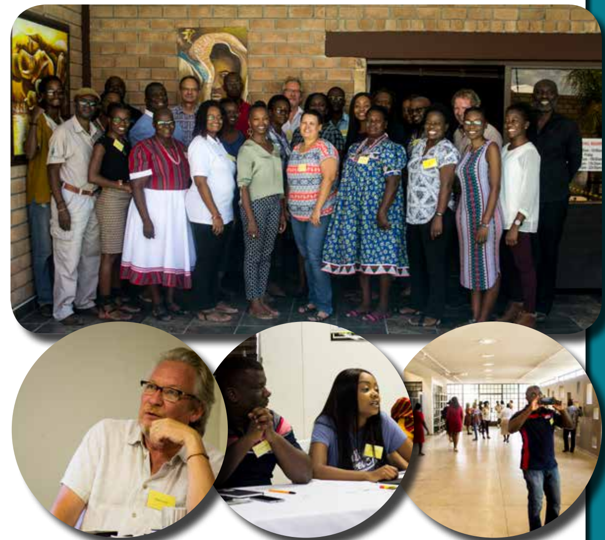
Museum of Namibian Music Stakeholders Workshop, Omuthiya

A stakeholders workshop was held in Omuthiya. Participants at the workshop established the initial Museum Advisory Committee, developed a draft exhibition skeleton for the new museum, paid a site visit to the museum building and discussed the challenge of establishing a comprehensive archive of Namibian music. A full report on the workshop is available upon request.