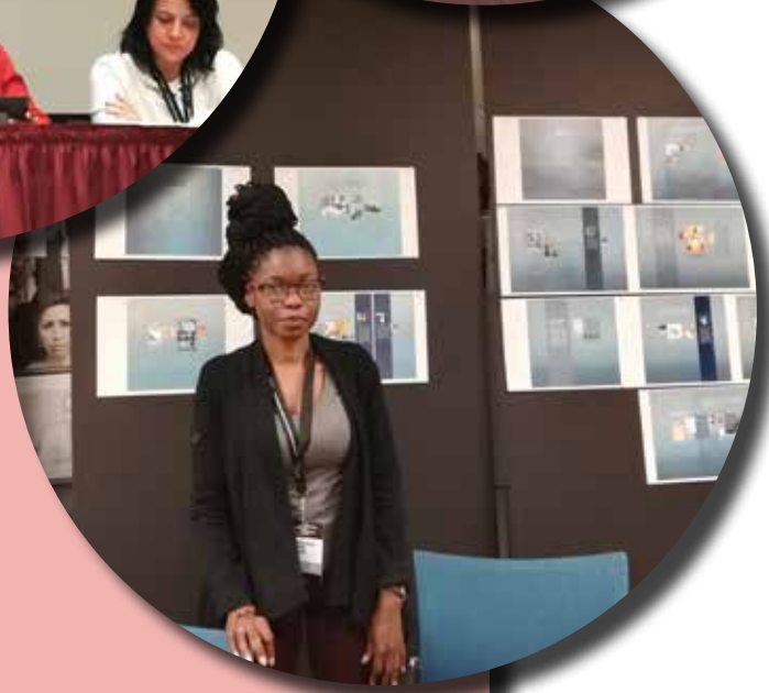
Participation in International Conference on Education and the Holocaust, Washington D.C., USA