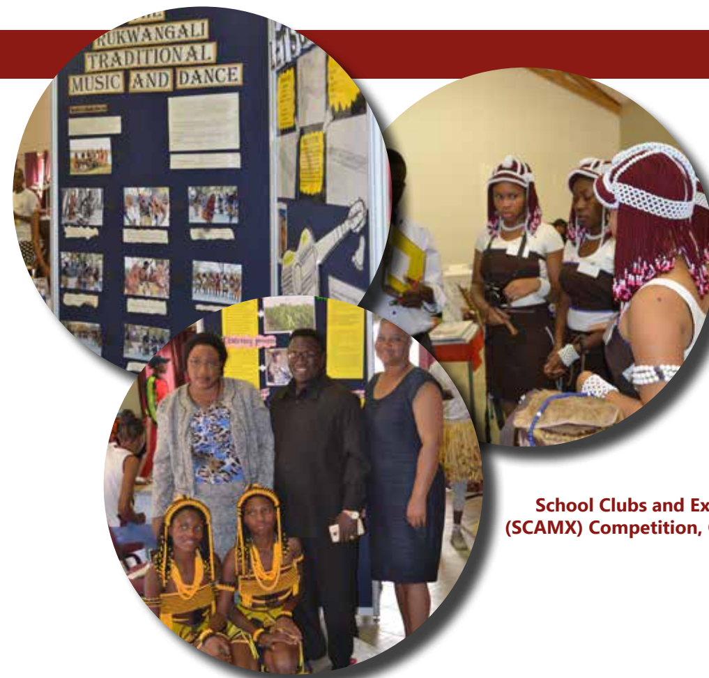
School Clubs and Exhibitions (SCAMX) Competition, Otjiwarongo

The Namibian Heritage Week Team 2018 had their first meeting in February 2018, and already decided on the 2018 theme: Turunganeni Kumwe (Let's work together).