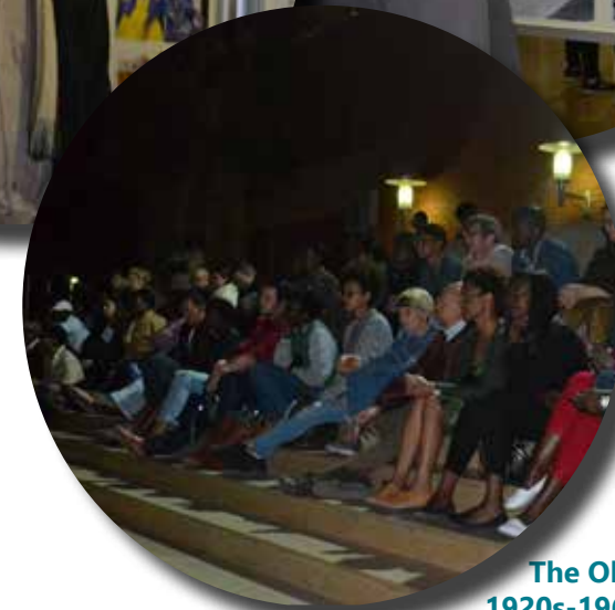
The Old Location Albums, 1920s-1960s Exhibition Launch, UNAM, Windhoek