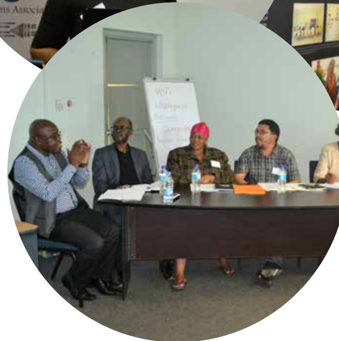
Human Remains Management and Policy Development for Southern African Museums Workshop, University of Namibia