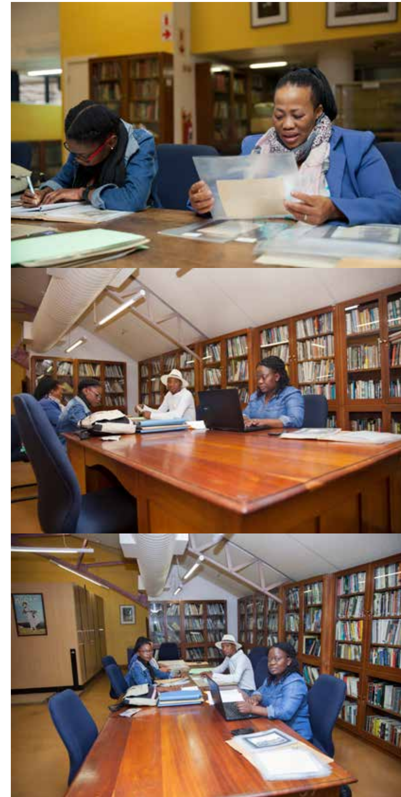
Research Trip to MuseumAfrica, Johannesburg