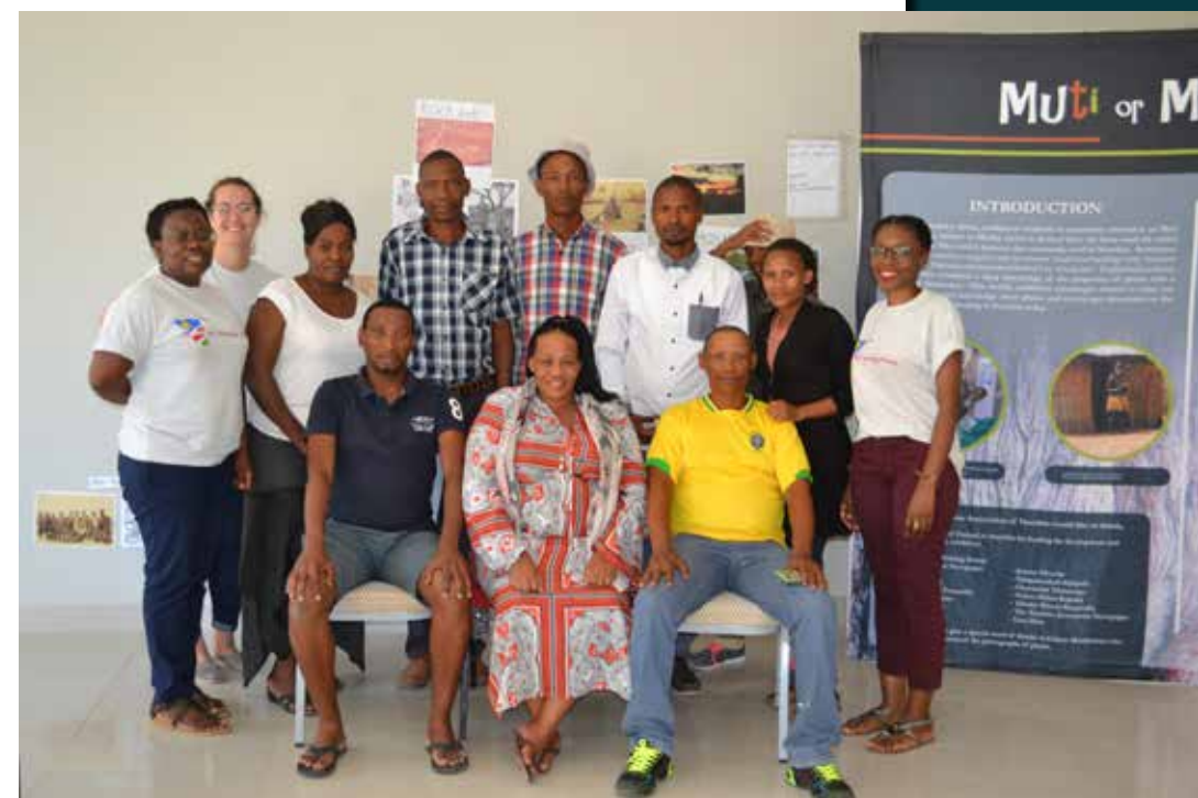
Namibia San Culture Stakeholder's Workshop, Tsumeb