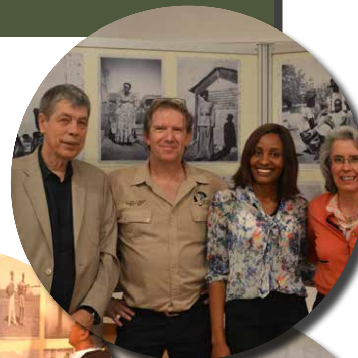
Usakos: Photographs Beyond Ruins. The Old Location Albums, 1920s-1960s: Exhibition Launch in Maputo, Mozambique